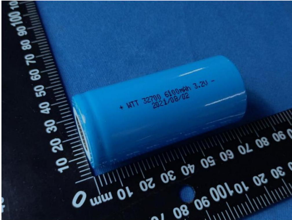
Figure 3 Overall view of cell