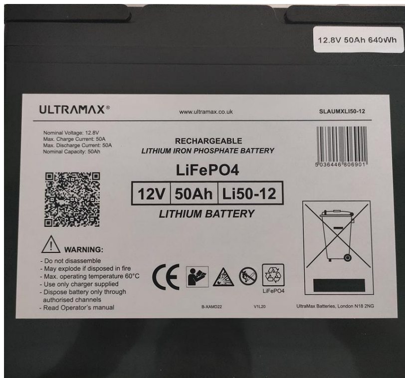
Figure 4 Battery Label