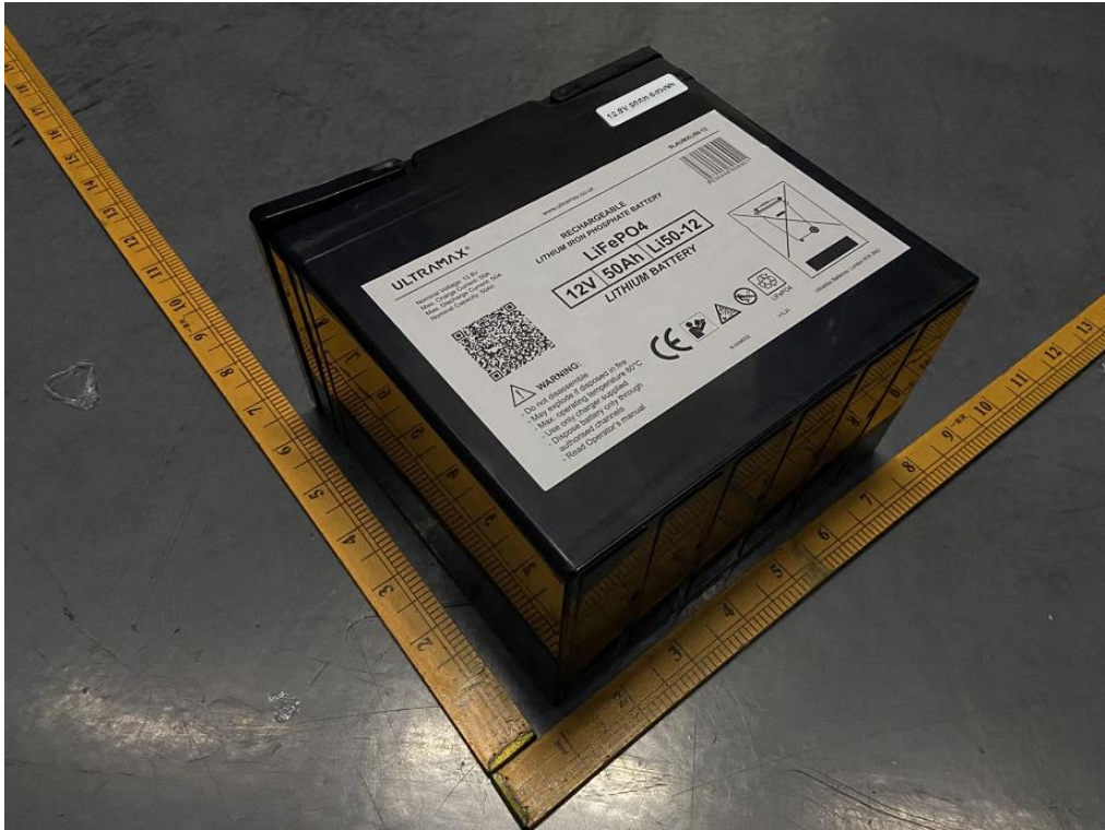
Figure 1 Overall view I of battery